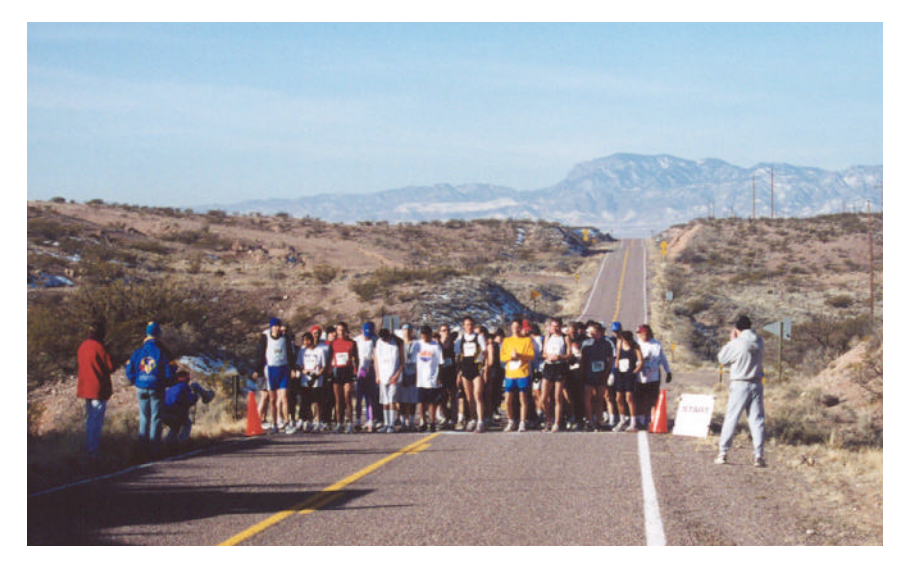
Athletes wait for the start of the Crusin' with the Cranes 15k Road Race.

[ Attached photographs are available electronic as *.jpg format. ]